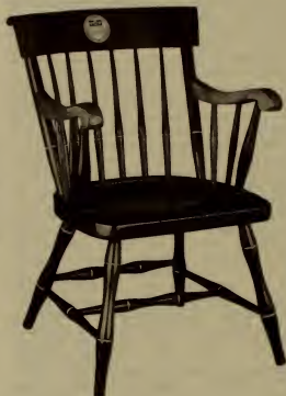
HUBBARD ARM CHAIR

ALL CHAIRS FURNISHED IN BLACK OR ANTIQUE MAPLE