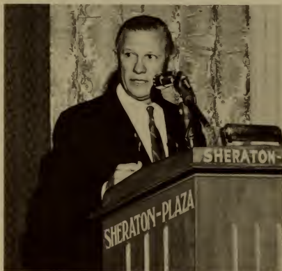
His excellency, Governor John A. Volpe of Massachusetts brings the greetings of the Commonwealth.

Three years in the hundred year span of a University's ex-