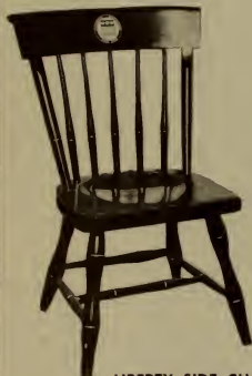
LIBERTY SIDE CHAIR

Need an extra chair for office or den? Here is a strong, sturdy Liberty design side chair. Gold trim and seal. Price: $25.00