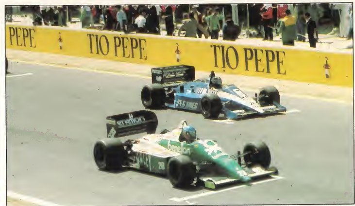
CIRCUITO DE VELOCIDAD DE JEREZ

C omplementary Activities. Throughout the five days of the Conference each participant will attend the following functions: Receptions give by various Bodies. Dinners and lunches given by different organisations. Flamenco shows. Visits to the Historical Centre of Jerez. A visit to González Byass Bodega (Wine Factory). The Show «How the Andalusian Horses Dance». We shall also celebrate other series of activities which will enliven the work days.