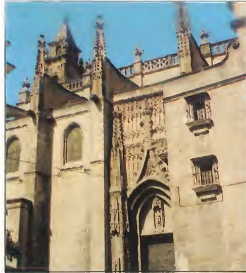
IGLESIA DE SANTIAGO