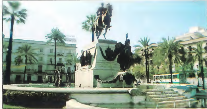
PLAZA DEL ARENAL

1 This decade sees the celebration of two hundred years of Flamenco since its first public appearance. This can be dated back to the year 1780. The Andalusian Flamenco Foundation, The Spanish Centre of the International Theatre Institute, Unesco and The National Institute of Scenic Arts and Music, haven't wished to let this singular event pass unnoticed and for this reason they have taken the initiative to organise the International Conference on «Two Centuries of Flamenco». The aim of this conference is to bring together, in Jerez, all those interested in the study of an artistic manifestation which has gone beyond the musical and scenic sphere