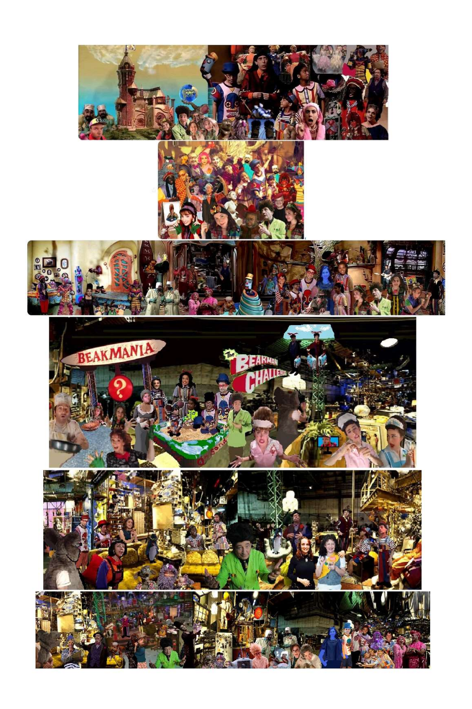
Beakman's World/Castelo Rá-Tim-Bum: The Complete Six Story Series