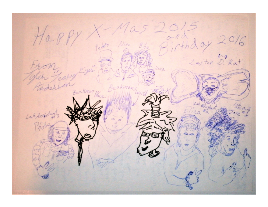
Happy X-Mas 2015 and Birthday 2016 . {Personal X-Mas greeting illustration.}