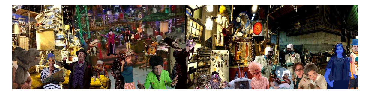
Originally posted in "Beakman Fans" on May 20, 2020.