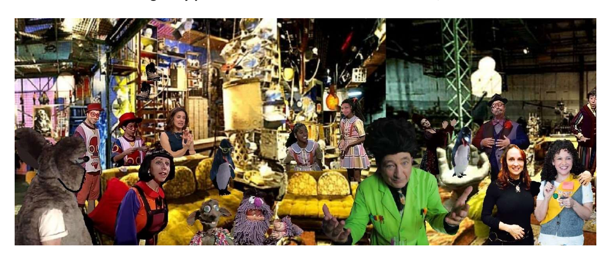
Originally posted in "Beakman Fans" on March 09, 2019.