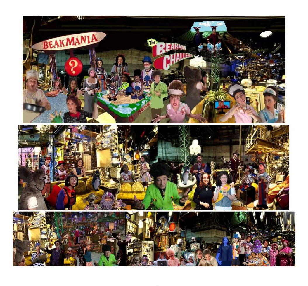
Beakman's World/Castelo Rá-Tim-Bum: The Complete Second Fan Fiction Trilogy