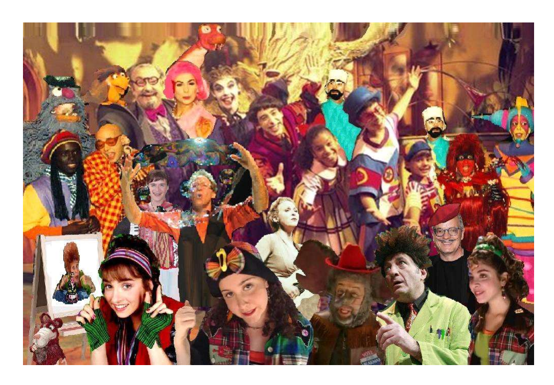
Originally posted in "Castelo Rá-Tim-Bum, Entusiastas" on February 21, 2016.