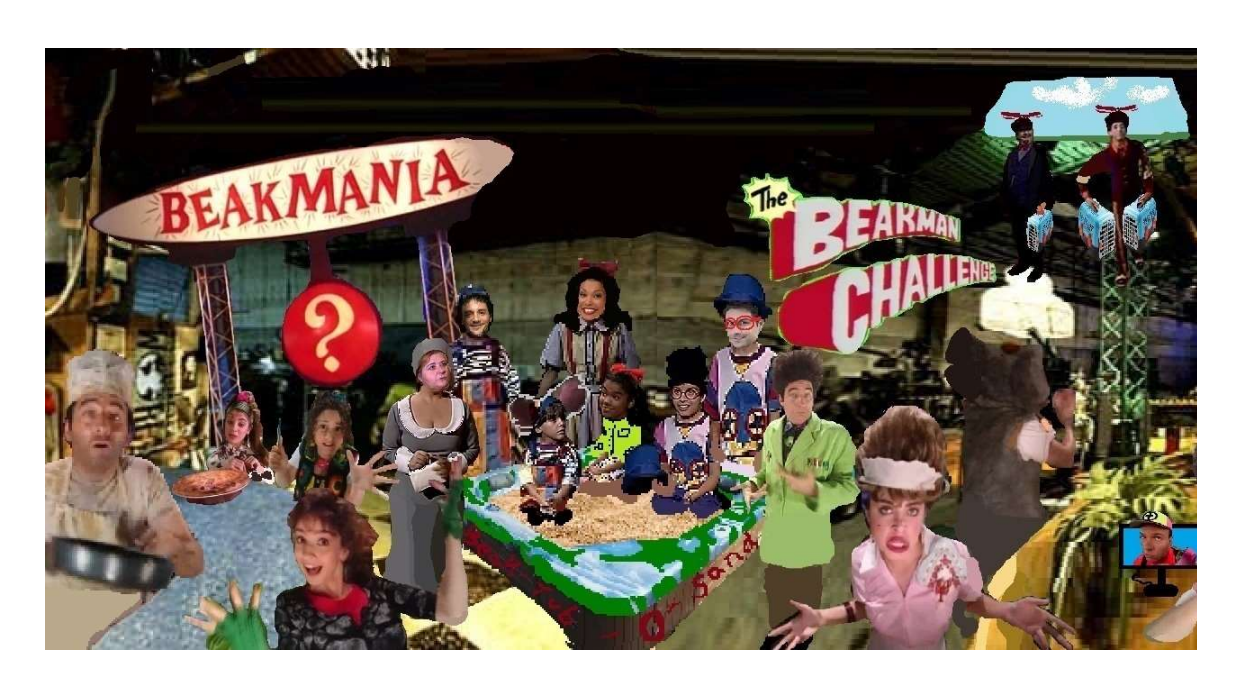
Originally posted in "Beakman Fans" on March 14, 2018.