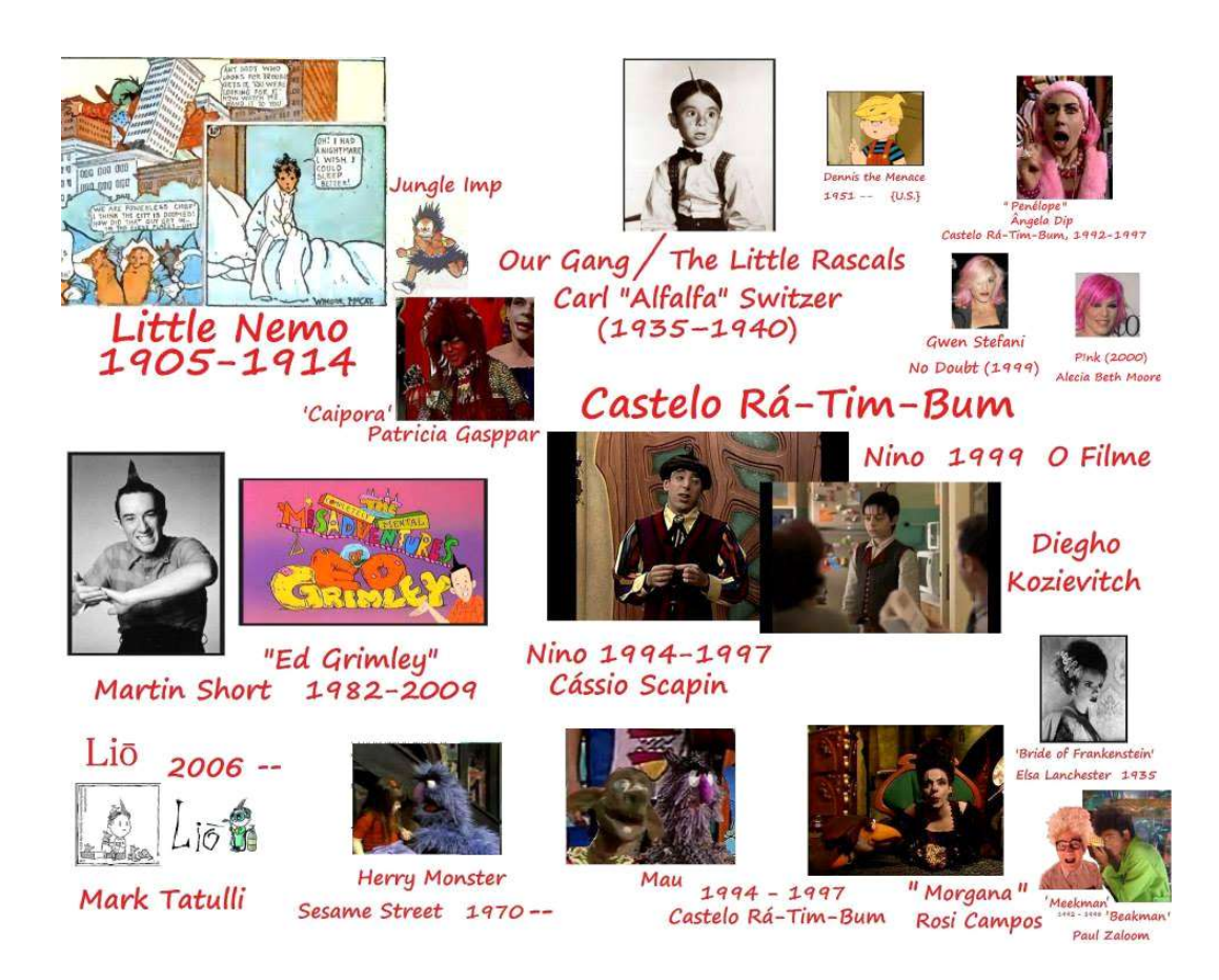
Originally posted in "Castelo Rá-Tim-Bum, Entusiastas" on March 20, 2015.