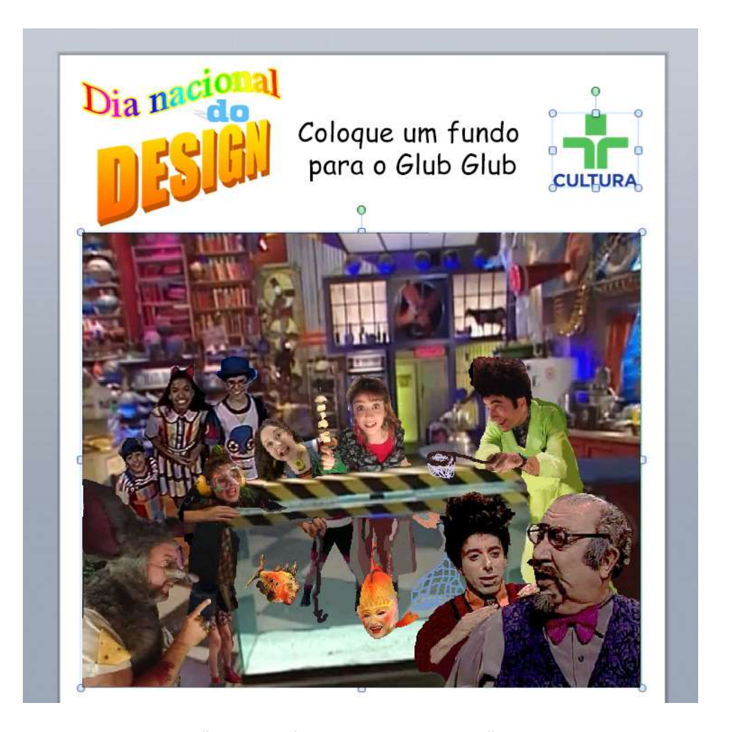
Originally posted in "Castelo Rá-Tim-Bum, Entusiastas" on November 7, 2016.

{"Teary Eyes" Anderson's entry in the TV Cultura design contest that had the Glub Glub fish on a blank background, and challenged the artists to create a world for the characters.}