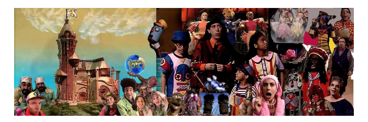
Originally posted in "Castelo Rá-Tim-Bum, Entusiastas" on April 18, 2015.